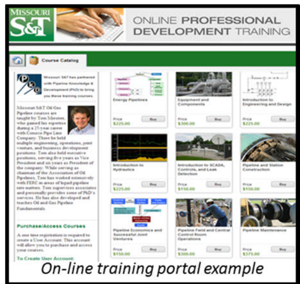
On-line training portal example

A thorough treatment of each training method is beyond the scope of this this article. Suffice-it-to-say,